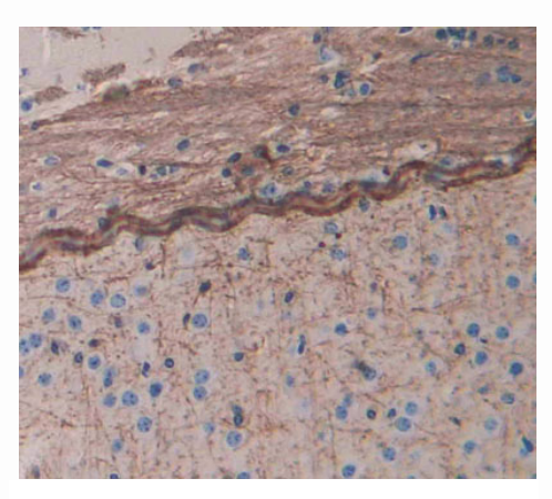
Used in DAB staining on fromalin fixed paraffin- embedded brain tissue

Used in Western Blot, Sample: Recombinant AGC, Mouse