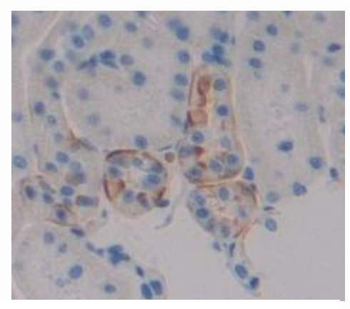
Used in DAB staining on fromalin fixed paraffin- embedded kidney tissue

Used in Western Blot, Sample: Recombinant HMGCR, Rat