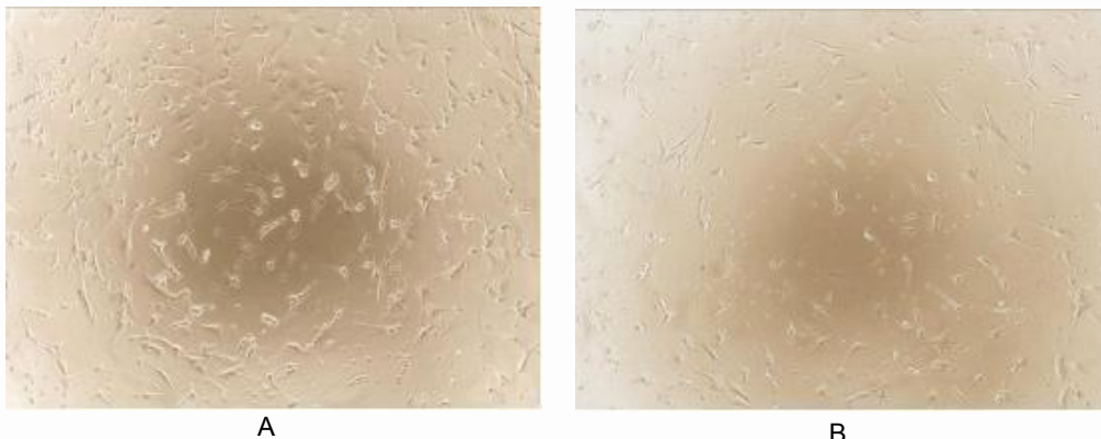
Figure 1. Cell proliferation of 3T3 cells after stimulated with AGE.

Glucose and other reducing sugars can react non-enzymatically with the amino groups of proteins to form compounds called advanced glycation end products (AGEs). AGEs exert their cellular functions via the interaction with receptor for advanced glycation end products (RAGE). It has been reported that AGE stimulates the differentiation and proliferation of 3T3, thus a proliferation assay was conducted using 3T3 cells. Briefly, 3T3 cells were seeded into triplicate wells of 96-well plates at a density of 2,000 cells/well and allowed to attach overnight, then the medium was replaced with serum-free standard DMEM prior to the addition of various concentrations of AGE. After incubated for 48h, cells were observed by inverted microscope and cell proliferation was measured by Cell Counting Kit-8 (CCK-8). Briefly, 10 \mu L of CCK-8 solution was added to each well of the plate, then the absorbance at 450nm was measured using a microplate reader after incubating the plate for 1-4 hours at 37°C. Proliferation of 3T3 cells after incubation with AGE for 48h observed by inverted microscope was shown in Figure1. Cell viability was assessed by CCK-8 (Cell Counting Kit-8 ) assay after incubation with recombinant AGE for 48h. The result was shown in Figure 2. It was obvious that AGE significantly increased cell viability of 3T3 cells.