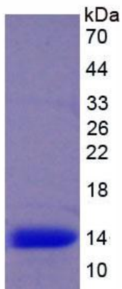
Figure 2. SDS-PAGE